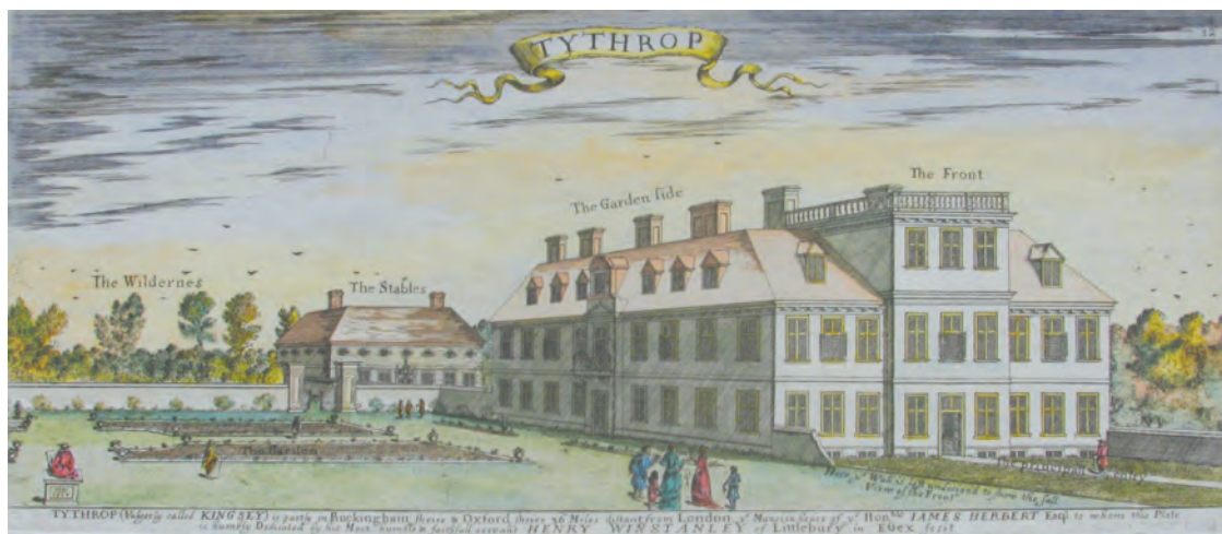
FIGURE 2 Engraving of Tythrop House, by Henry Winstanley, 1680. From: Buckinghamshire Archaeological Society, Historic Views of Buckinghamshire (Buckinghamshire Archaeological Society 2004)

In April 1931, after the fall of the Spanish monarchy, an alliance of left-wing parties, having established a 'Popular Front' government, proclaimed a Republic. Jubilation soon gave way to unrest as the government was well-meaning but