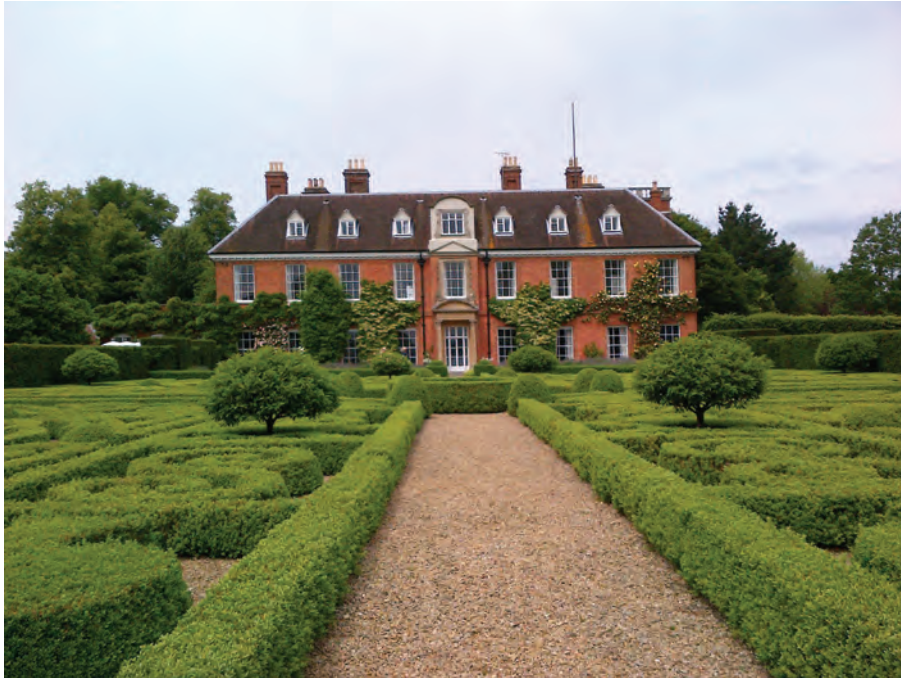
FIGURE 3 Tythrop House 2013.

The National Joint Committee for Spanish Relief (NJCSR) had been formed in England in late 1936 to coordinate all the voluntary relief to Spain being undertaken by a plethora of political and non-political organisations. The Committee, set up by Liberal MP Wilfred Roberts, and chaired by Conservative MP the Duchess of Atholl, included Leah Manning, a past President of the National Union of Teachers, social reformer and Labour MP. Manning had visited Spain in 1934 and was bitterly critical of the repression which she witnessed. In April 1937 she was asked by the Basque delegation in London to go to Bilbao. Two days later Guernica was bombed: she visited the town and gave a