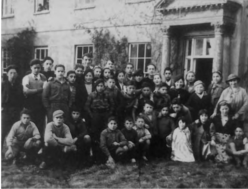
FIGURE 4 Basque children and staff outside Tythrop House, 1937 or 1938.

Children continued to arrive during and after November 1937. The BCC's Minutes of the Execu-