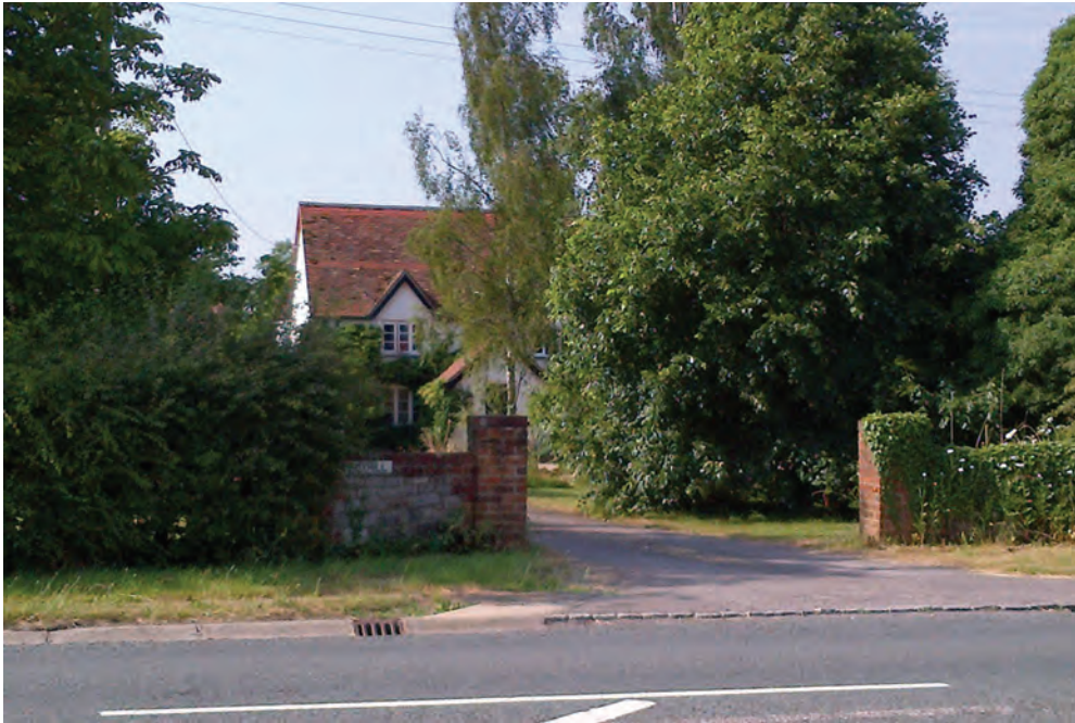
FIGURE 5 Foxhill Farmhouse, 2013.

but on inspection he found that the domestic hot water system had been emptied by workmen, employed by the Langham Committee, and not turned back on. Within two days Morris was back at Tythrop, this time to find that the only problem was a blown fuse. Magdalen was not impressed with the competence of the workmen employed! 69