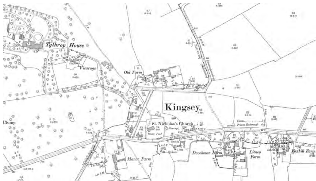
FIGURE 1 Map of Kingsey. Ordnance Survey 25" scale, 1898