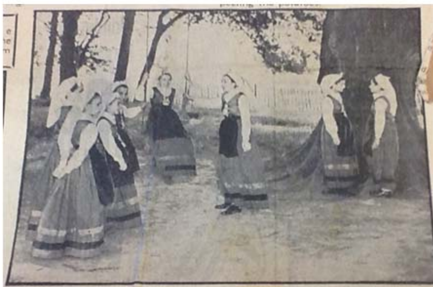
Dancing in the Grounds of Aldridge Lodge The Birmingham Gazette

Their days at the lodge according to one of the accounts were happy ones even though most of them were desperate to return to Spain – remember, most of these children were too young to understand what was happening in Spain at the time and had no idea what had happened to their families.