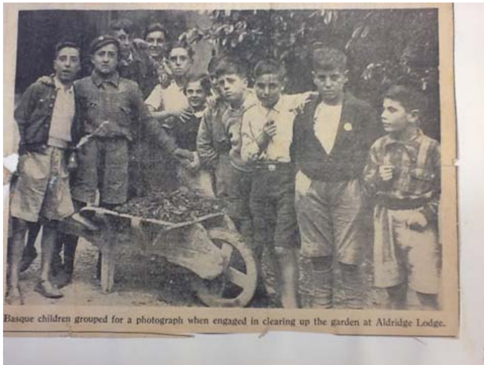
The Birmingham Gazette

The reports about the children were exceptionally good in that they were clean, obedient and willing to help. For the girls their day consisted of making beds, cleaning, helping with making the meals and education. For the boys they helped in the gardens, repaired anything that need repairing and had schooling most days.