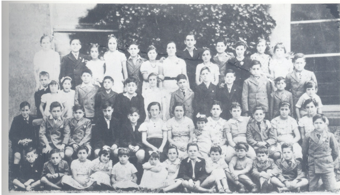
513. Grupo de niños vascos de la colonia de Walsall.