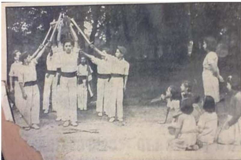
Dancing in the Grounds of Aldridge Lodge The Birmingham Gazette