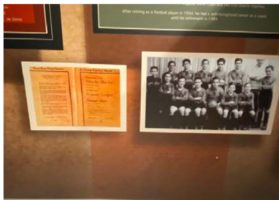
Some images of the exhibition at the San Mamés stadium