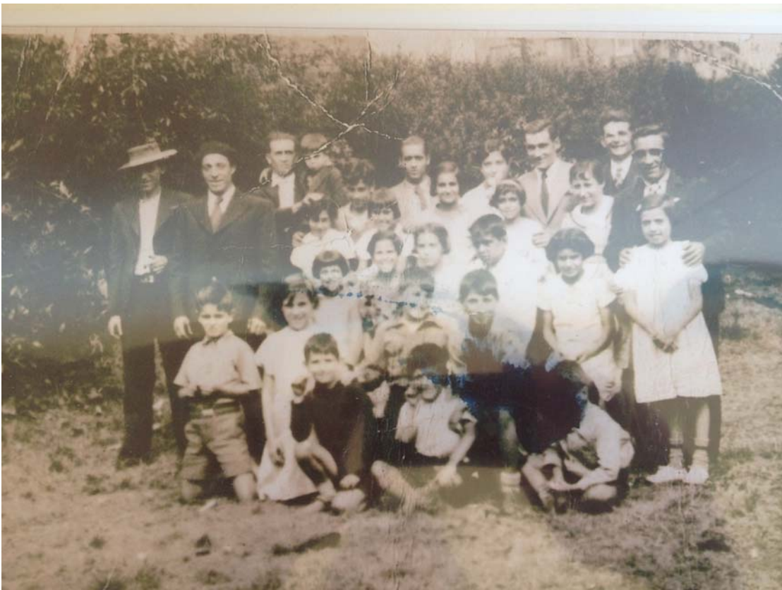
The group photo of the children and helpers and their Spanish teacher.

Arm in arm they look out on us and seem to ask why?'