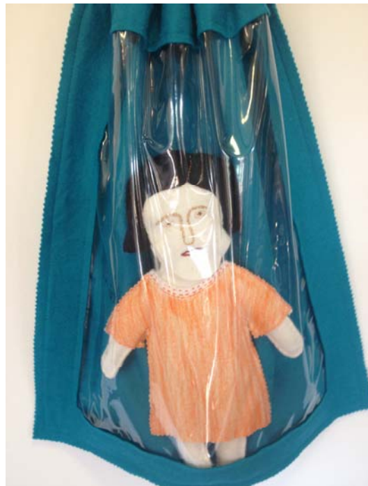
One of the cloth dolls reproduced from a group photo of the children in Salford