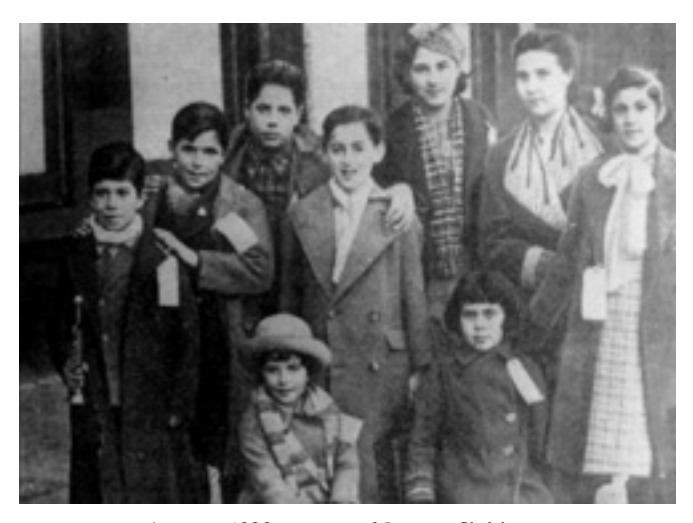
January 1938 a group of Basque Children returning