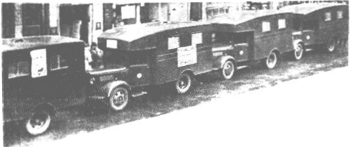
Four ambulances including the ones from Wandsworth and Battersea lined up in New Oxford Street ready for departure to Spain in February 1937.