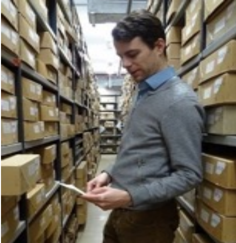
Member of Special Collections staff fetching archive material from the strongroom.

This Basque child refugee archive, whilst perhaps a more modest portion of the over 7 million manuscript items that now are held in the Special Collections, provide an important addition and a unique perspective to the extensive holdings relating to the refugee and transmigration experience at the University. The collections are stored in the purpose built strongrooms, maintained at the recommended British standards for the preservation of archival material.