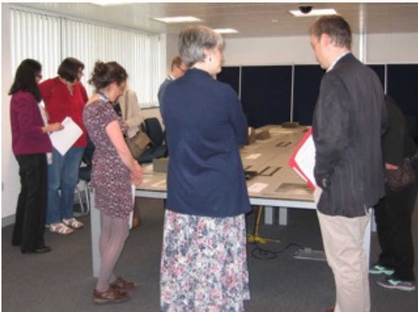
Explore the Collections event

The Basque collections have been the subject of various research projects, both for students at the University of Southampton and from elsewhere, including undergraduate group projects for both history and film students, and have supported research into family history. The material features as part of sessions run by the Special Collections staff introducing students to research and collections and as part of the ongoing Explore the Collections programme of drop-in sessions for members of the public to meet the curators and find out more about the holdings.