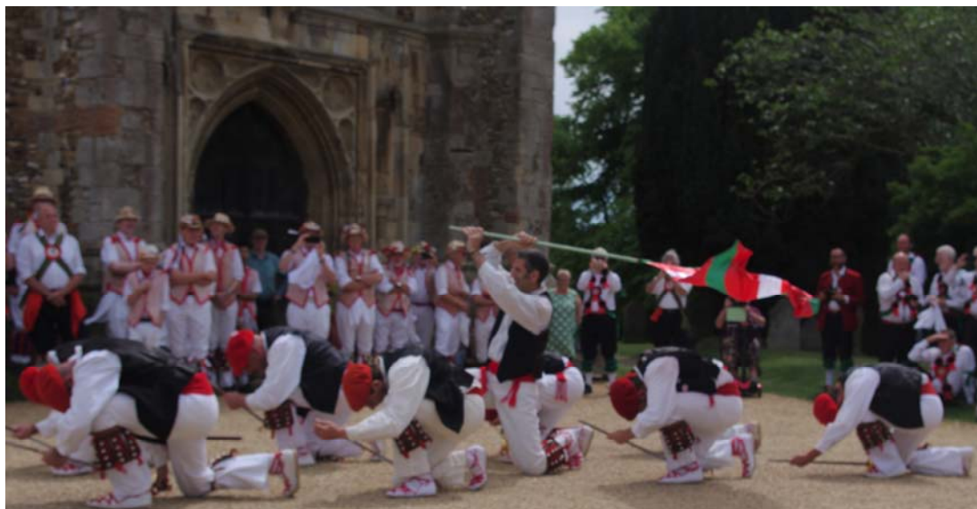
Thaxted 1939 above ↑

The weather was truly glorious for the whole weekend. On Saturday the groups travelled through this part of Essex performing at many beautiful and picturesque villages pubs. On both Saturday and Sunday Town Street in the historic village of Thaxted saw crowds enticed out by the weather to watch the dancing. All the groups both local and visitors were given a warm welcome; the athletic high kicking Basque dances accompanied by the txistu (pipe and drum) surprised and delighted the audiences.