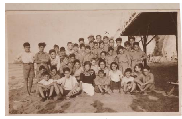
Colony in East Cliff House, Cliftonville, Margate 1937