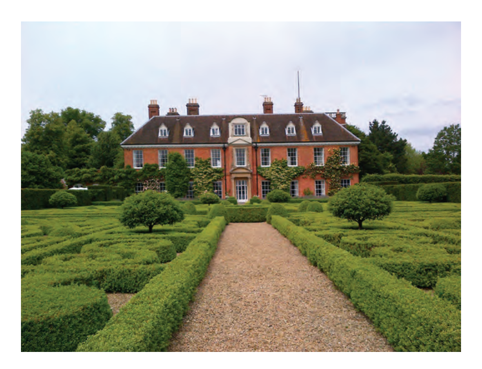
FIGURE 3 Tythrop House 2013.