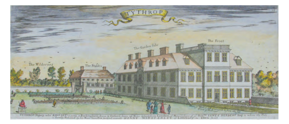
FIGURE 2 Engraving of Tythrop House, by Henry Winstanley, 1680. From: Buckinghamshire Archaeological Society, Historic Views of Buckinghamshire (Buckinghamshire Archaeological Society 2004)

In April 1931, after the fall of the Spanish monarchy, an alliance of left-wing parties, having established a 'Popular Front' government, proclaimed a Republic. Jubilation soon gave way to unrest as the government was well-meaning but