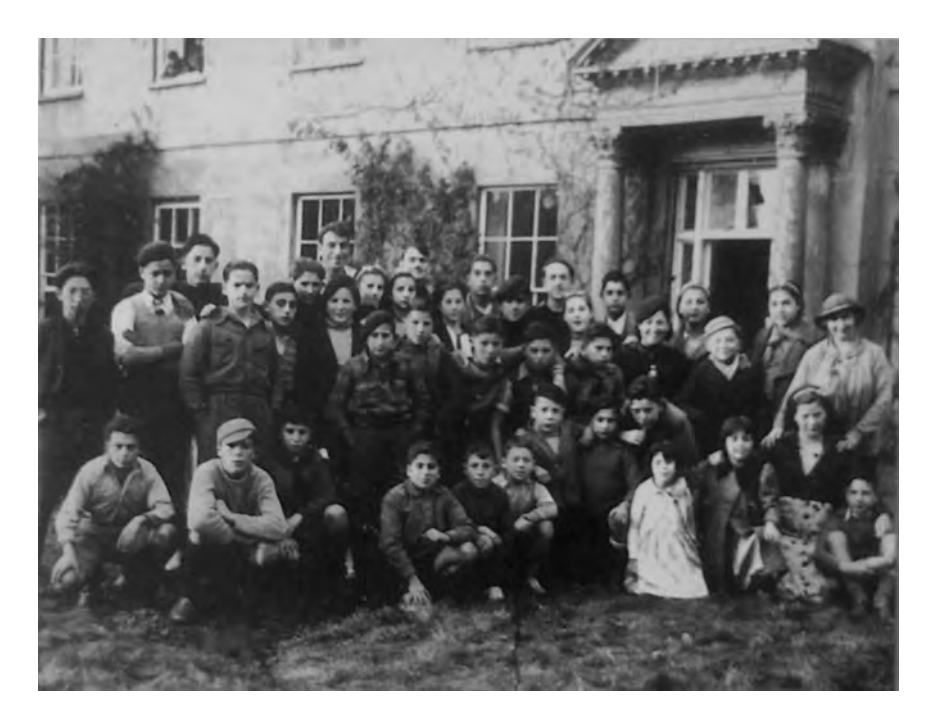
FIGURE 4 Basque children and staff outside Tythrop House, 1937 or 1938.

Children continued to arrive during and after November 1937. The BCC's Minutes of the Execu-