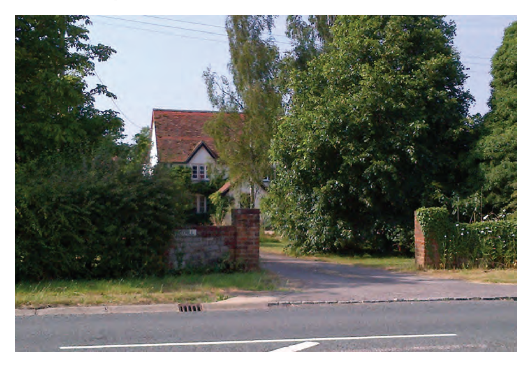
FIGURE 5 Foxhill Farmhouse, 2013.

but on inspection he found that the domestic hot water system had been emptied by workmen, employed by the Langham Committee, and not turned back on. Within two days Morris was back at Tythrop, this time to find that the only problem was a blown fuse. Magdalen was not impressed with the competence of the workmen employed!<sup>69</sup>