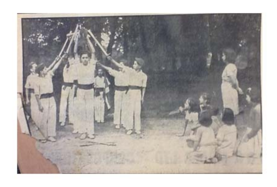
Dancing in the Grounds of Aldridge Lodge The Birmingham Gazette