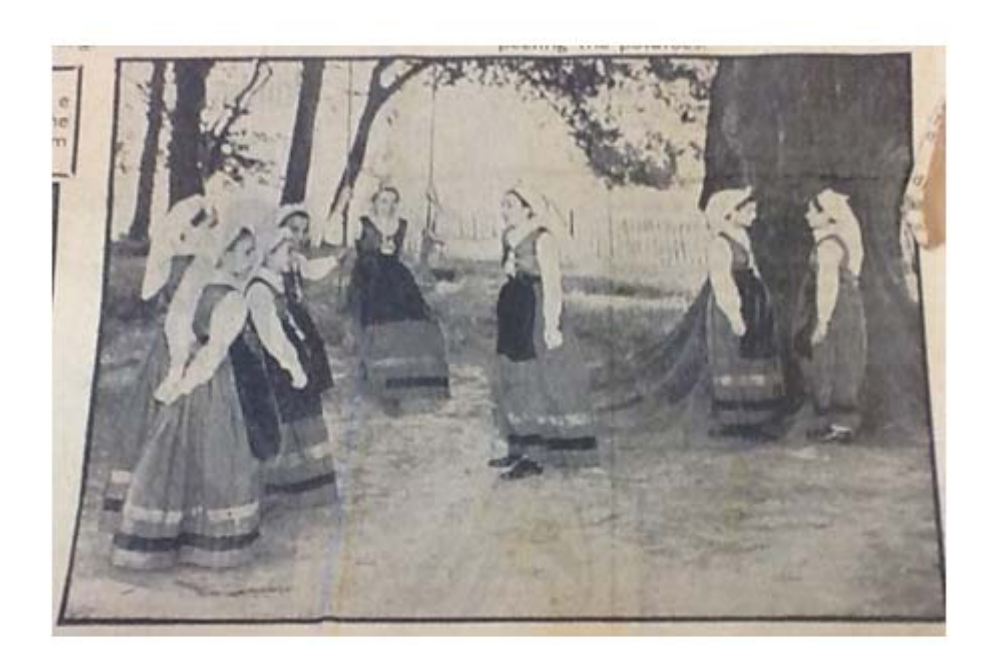
Dancing in the Grounds of Aldridge Lodge

Their days at the lodge according to one of the accounts were happy ones even though most of them were desperate to return to Spain – remember, most of these children were too young to understand what was happening in Spain at the time and had no idea what had happened to their families.