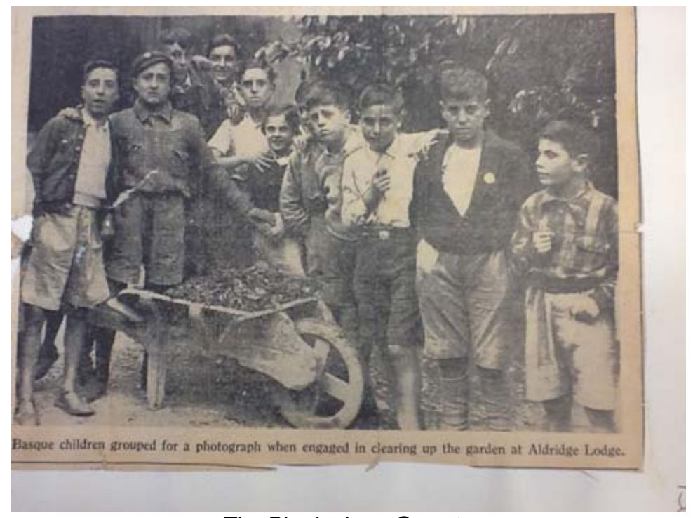
The Birmingham Gazette

The reports about the children were exceptionally good in that they were clean, obedient and willing to help. For the girls their day consisted of making beds, cleaning, helping with making the meals and education. For the boys they helped in the gardens, repaired anything that need repairing and had schooling most days.