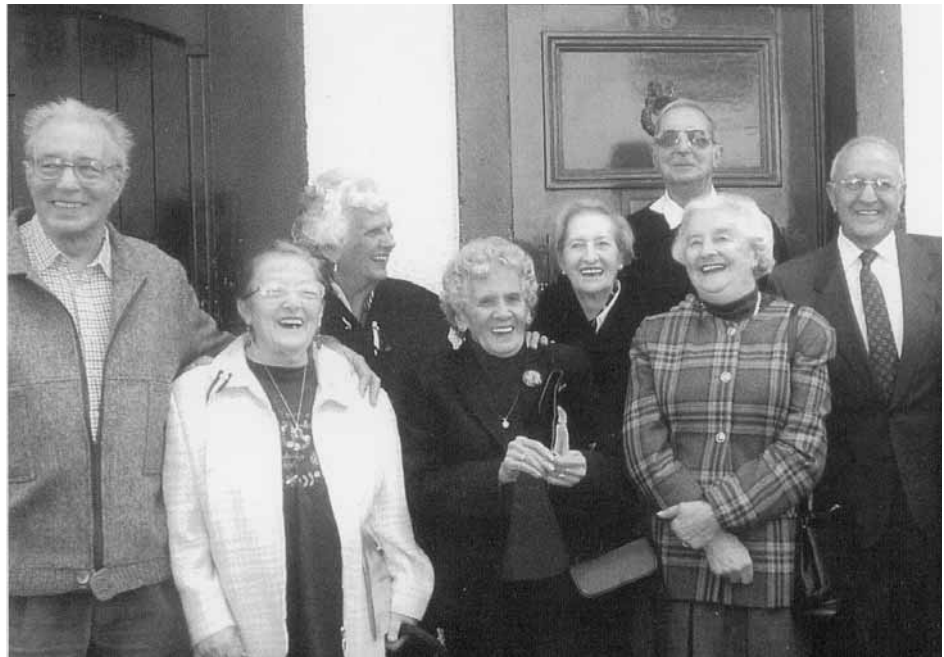
Niños outside Pendragon House, Caerleon, after the unveiling of the blue plaque.

Caerleon was a little bit of heaven after the horrors of the Civil War in Spain. The original house where they had been looked after for