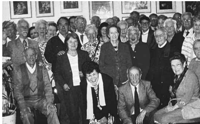
Some of the niños, friends and family at the annual reunion lunch in May.