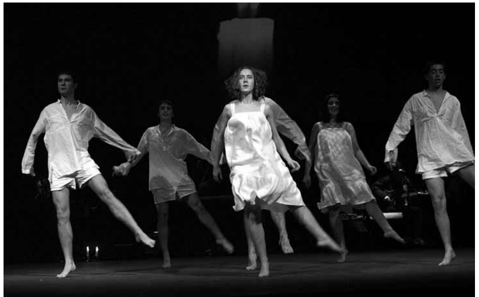
The Kukai dance company from San Sebastián performed at a week-long series of events at Eastleigh to commemorate the 70th anniversary of the arrival of the niños vascos. See page 3: "Los Niños de Guernica Project, Eastleigh".