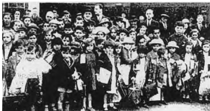
Basque children arriving at Derby's Friargate Station on 17 June 1937