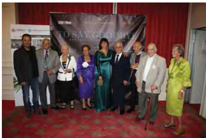
Niños at the screening of To Say Goodbye