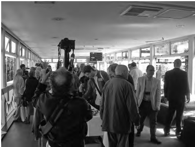
The entrance area: niños everywhere