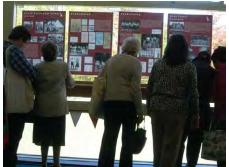
Remembering the days in the colonies: viewing the BC'37A boards