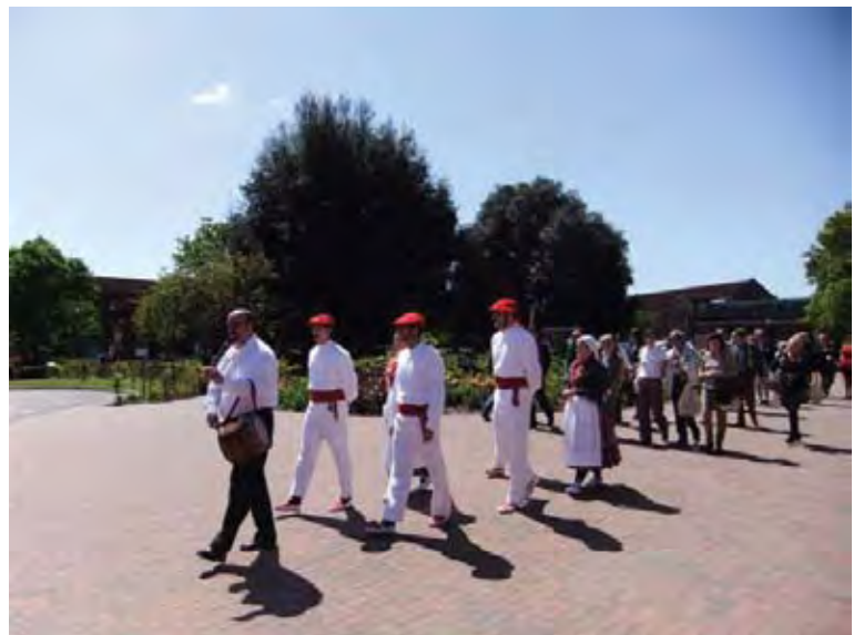
Led by the dantzaris to Garden Court