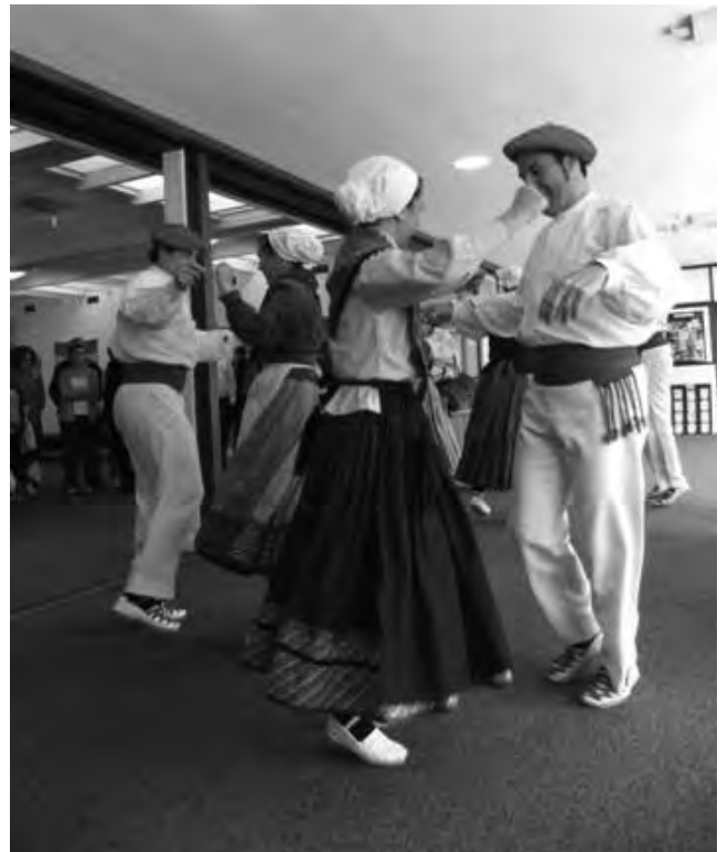
Keska Dantza Taldea