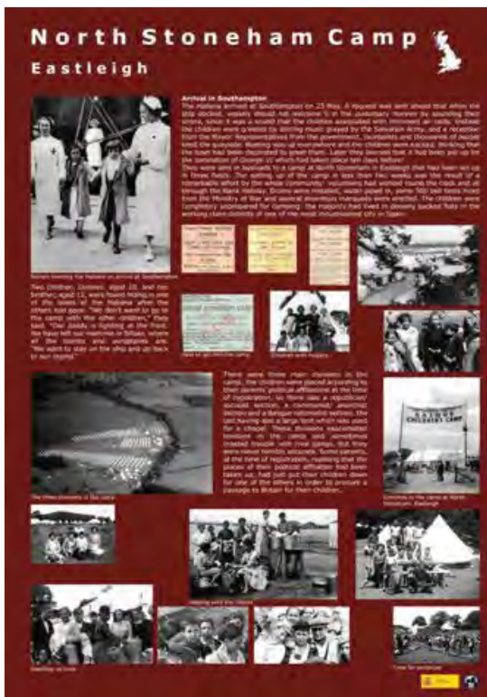
One of the BC'37A exhibition boards