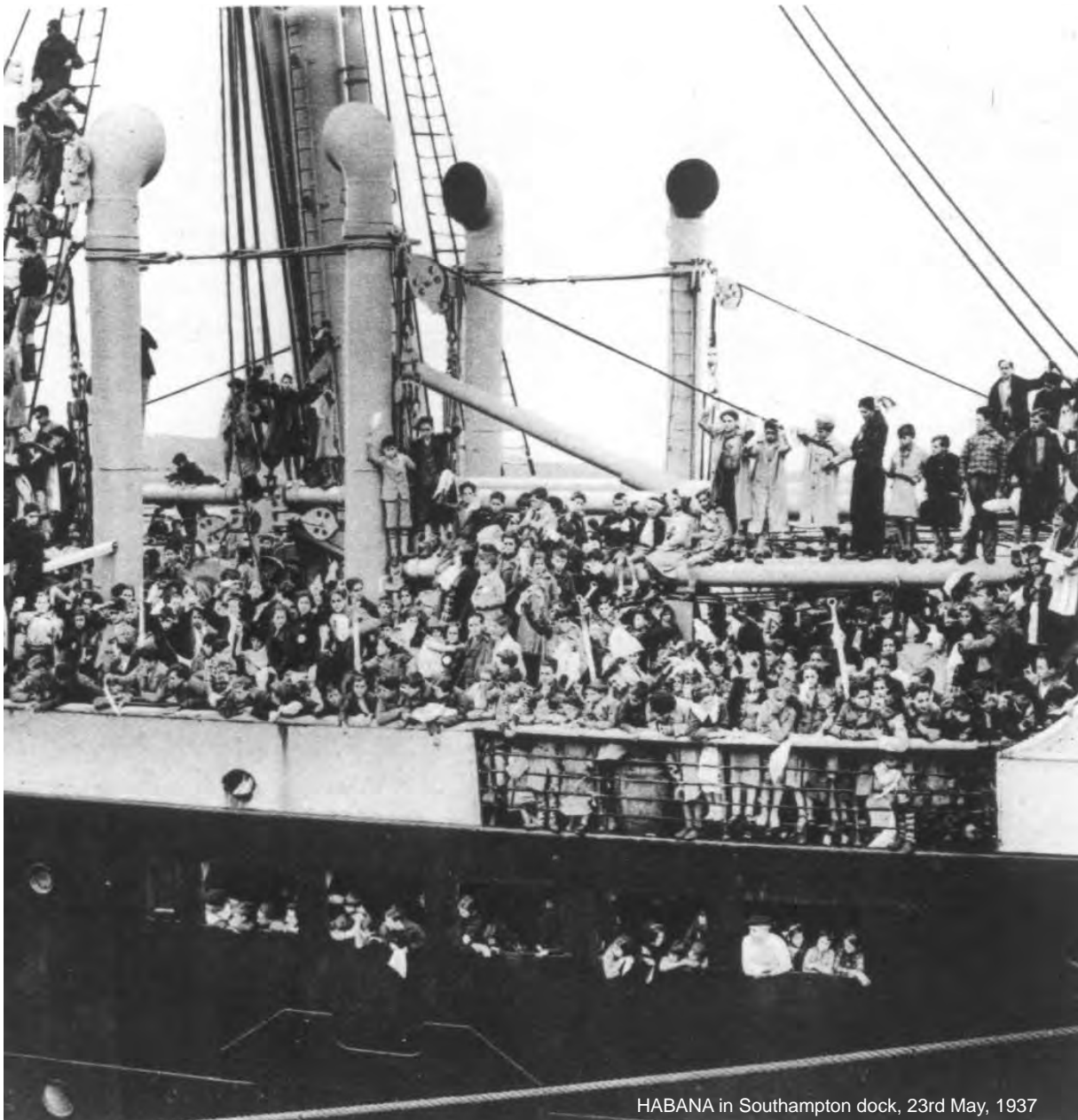
HABANA in Southampton dock, 23rd May, 1937