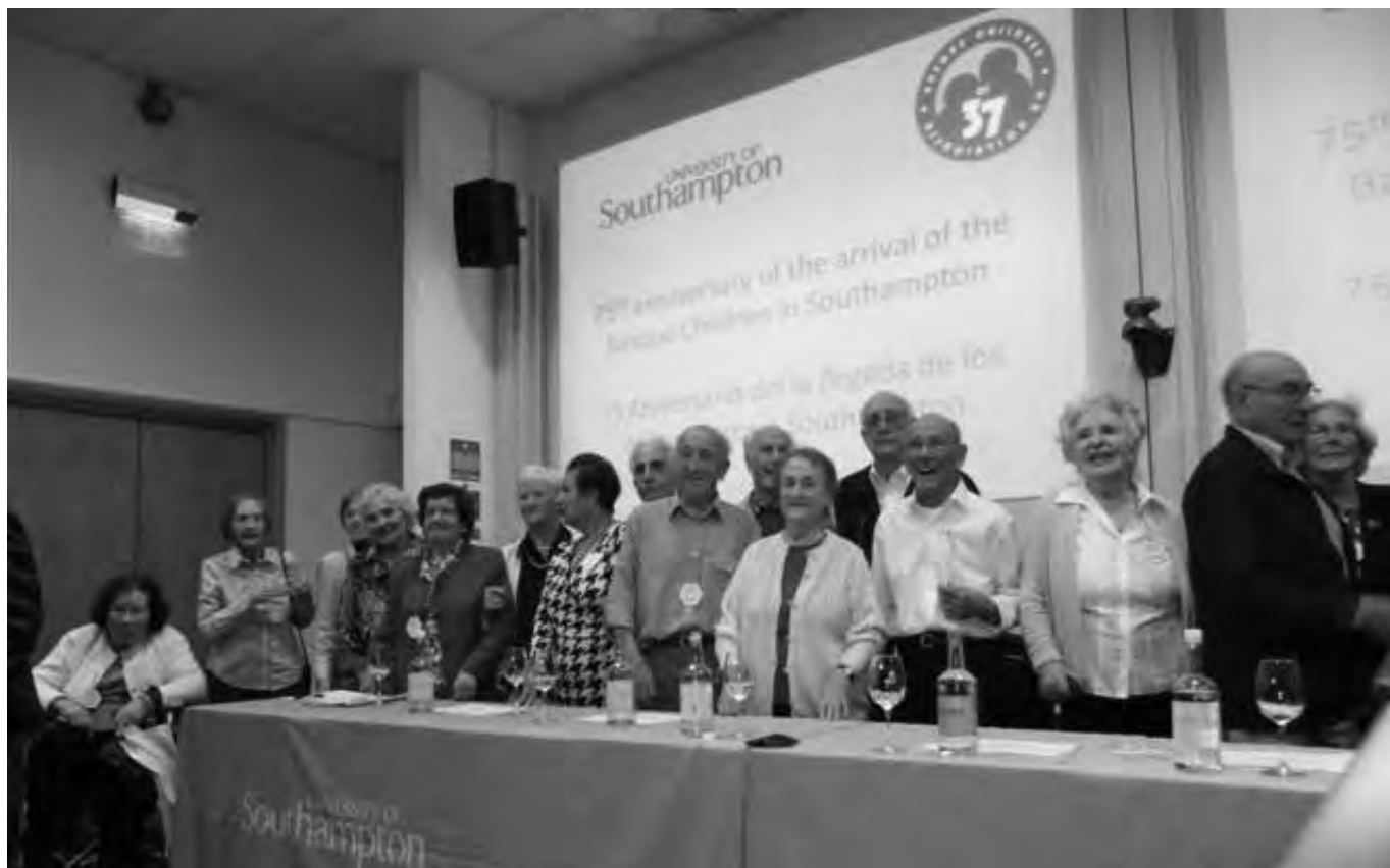
Niños on the platform