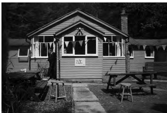
The Glade, Blackboys

The wooden plaque at the Blackboys colony. 'The Glade' is a modern name; during the time it was a colony it was always called simply 'Blackboys'.