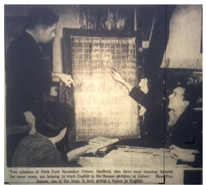
Volunteer children from Firth Park Secondary School teaching English at Froggatt Guest House

The children were also involved in the fundraising activities for themselves and for the BCC. Dressing up 'in the gaily coloured costume of their race' they 'lined the stairway up to the ballroom of the Cutlers Hall'xxv at a fundraising entertainment featuring song and dance hosted by the Master and Mistress Cutler.