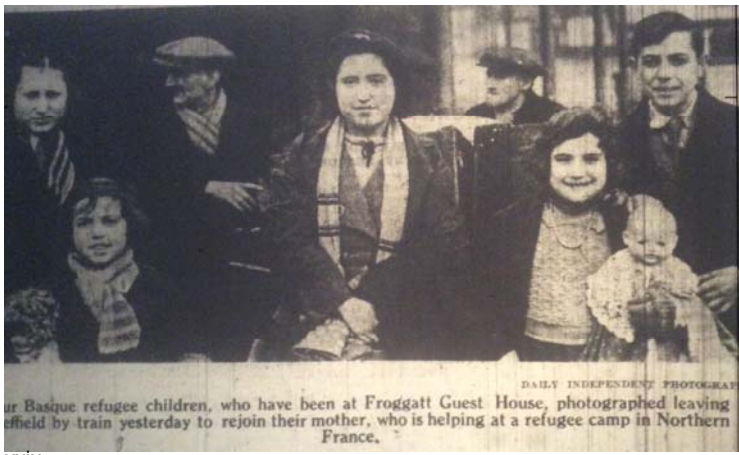
Four children leaving Sheffield to join their mother in Northern France.

From the Sheffield papers they continued to report the national and local situation reporting in January 1938 the tearful departure of some 500 of the children<sup>xxviii</sup> contrasting with a happy account of 4 of the Sheffield colony setting off to be reunited with their mother at a refugee camp in northern France in April 1938.