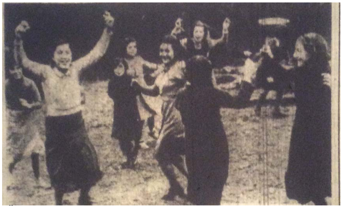
Traditional dancing in the gardens of Froggatt Guest House