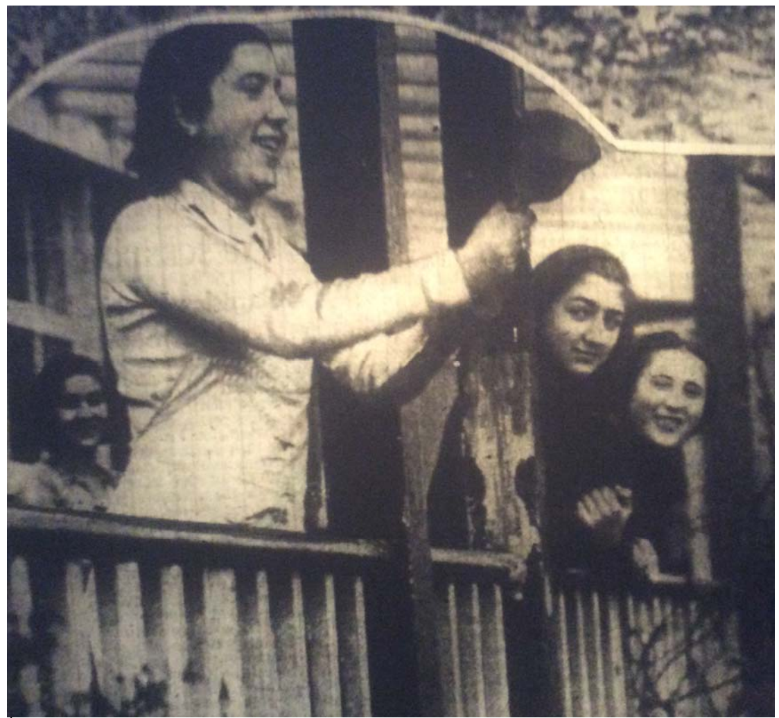
"...come to the cook house door" girls ringing the bell to call the Basque children to a meal. Sheffield Colony, Froggatt Edge Guest House.

the story of the Colony at Froggatt, Derbyshire, and the support given to child refugees of the Spanish Civil War by the people of Sheffield.