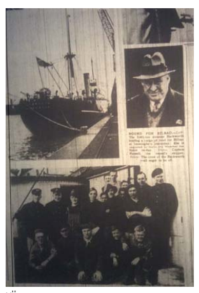
vii Food Aid to Spain

The collection of food – tins and dried goods - was organised in Sheffield and collected in a barge which was taken along the canals to the port of Hull where it joined collections from other cities to be shipped to Bilbao. vii