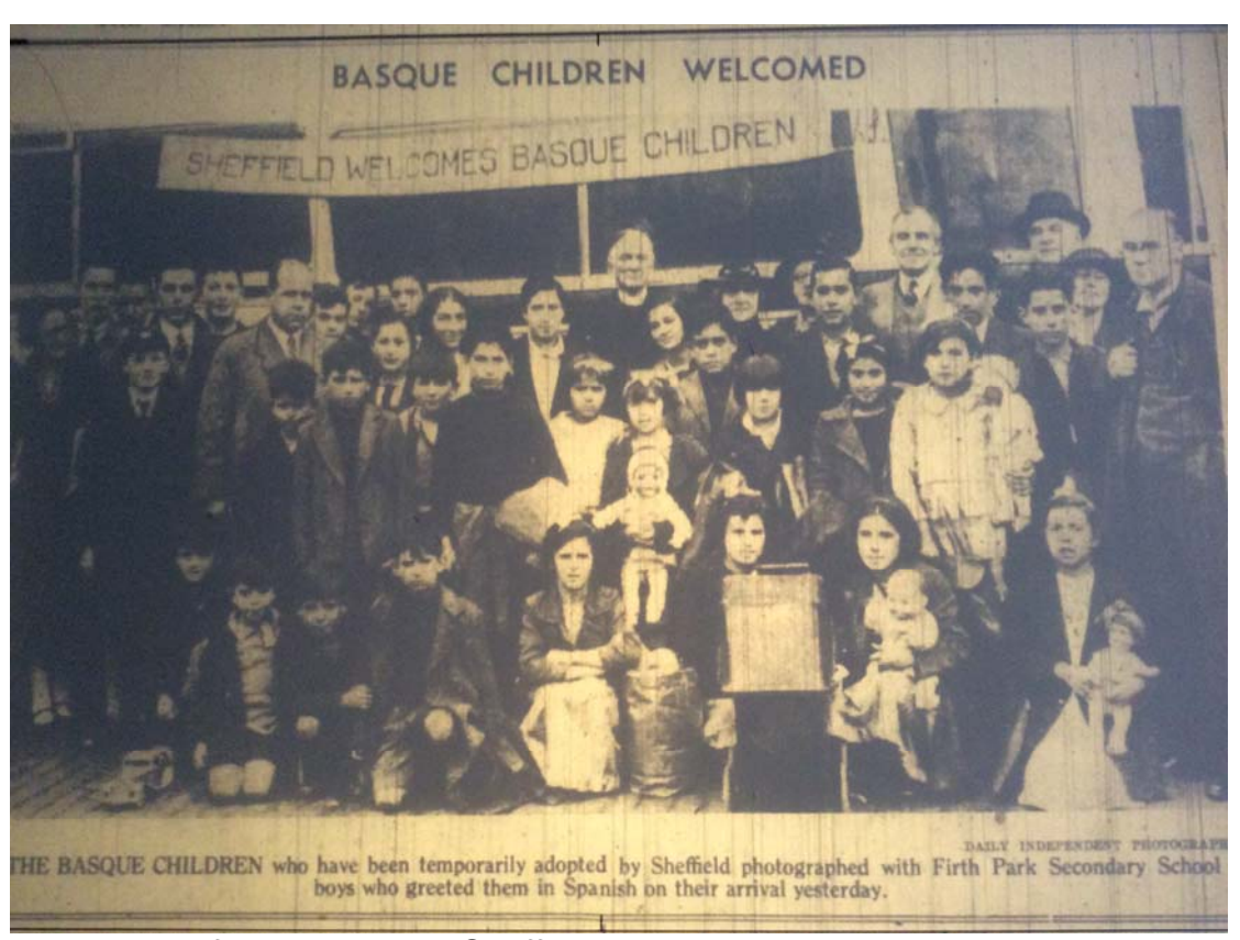
The arrival of the children at Sheffield station

The 4,000 children evacuated from Bilbao on the 'Habana' had been accompanied by priests from the Catholic Church, and teachers known if they were female as maestras , or assistants known as auxiliares . There were 96 maestras and 118 auxiliares who travelled on the 'Habana' . The maestras had been introduced as part of the educational reforms of the Republican government. Those that remained in Spain were ill treated by the Nationalists as they took control of Republican areas. The educational reforms were reversed and education returned to the Catholic Church. Of note the Catholic Church in most of Spain with the exception of the Basque country supported the insurgents. The Basque priests in contrast supported their Basque government.