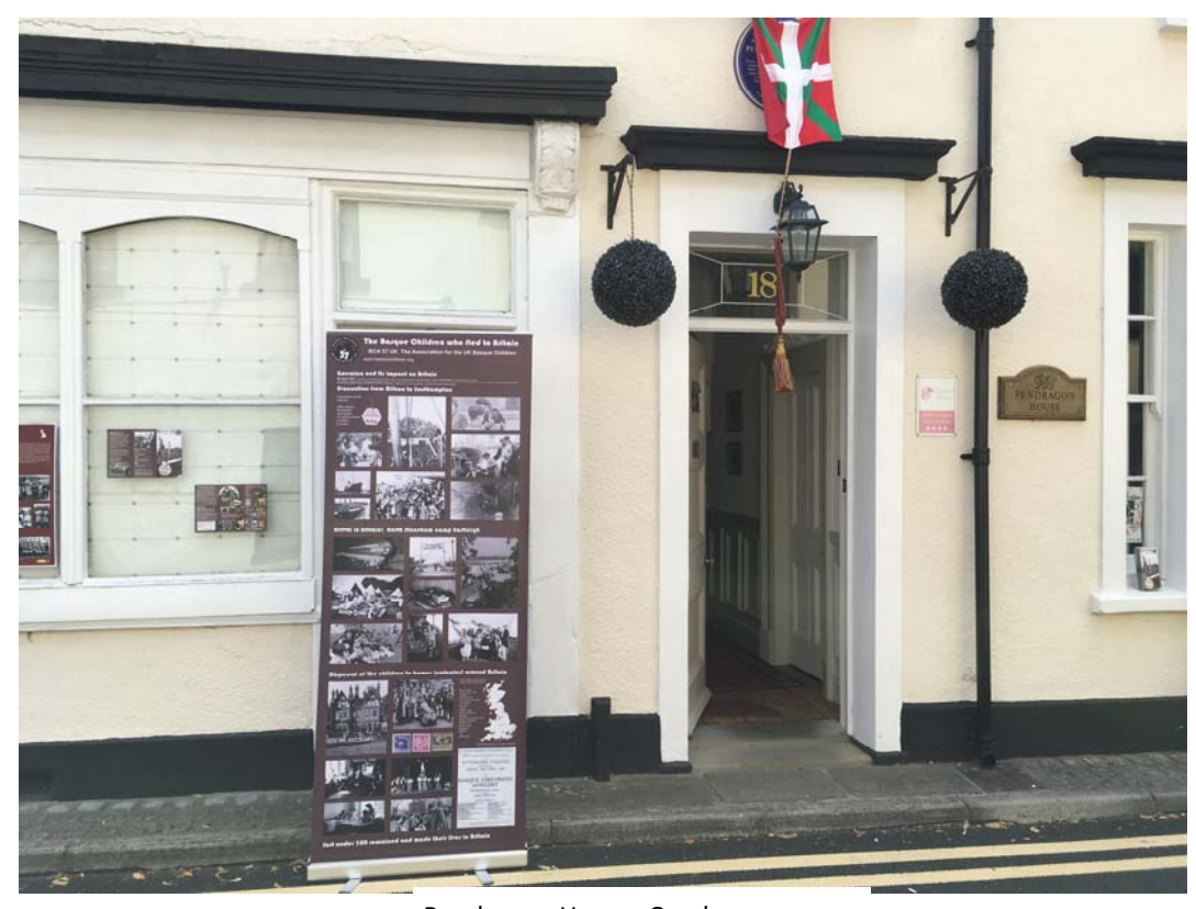
Pendragon House, Caerleon

This took place on Tuesday the 10th of July 2018 at 12.00 midday, outside Pendragon House, Cross Street, Caerleon NP18 1AF.