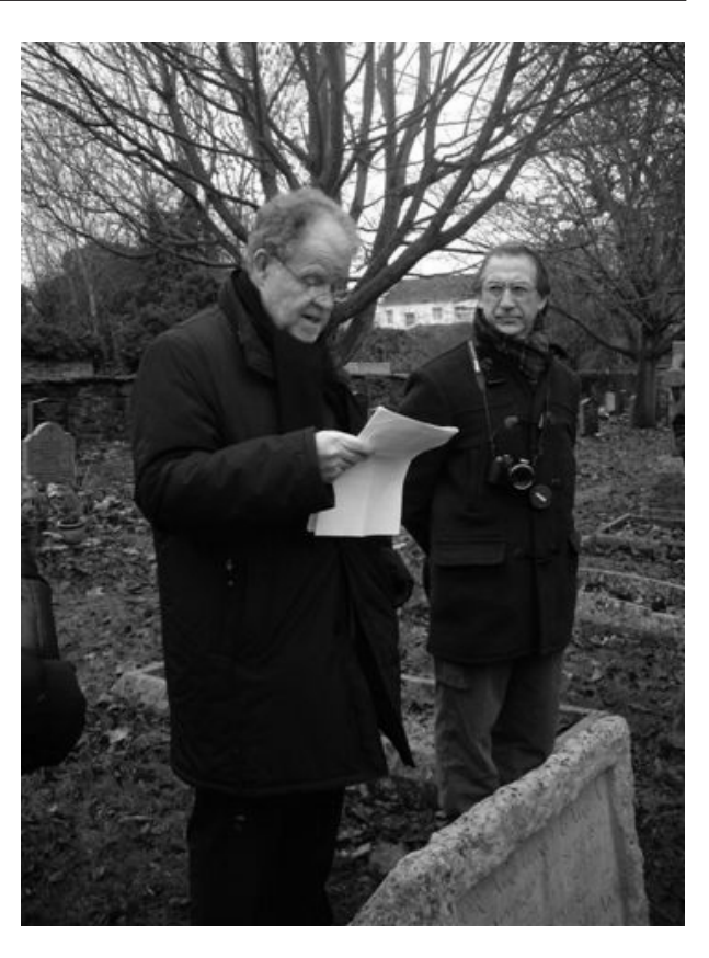
In the churchyard of All Saints, Faringdon, 4 December 2010