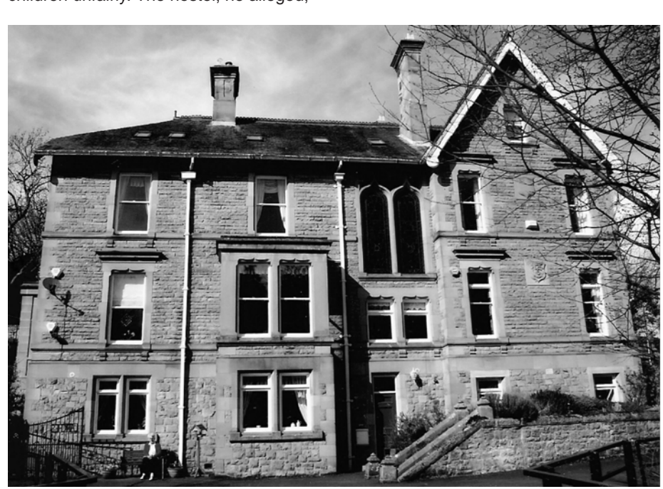
"The Larches", Hexham